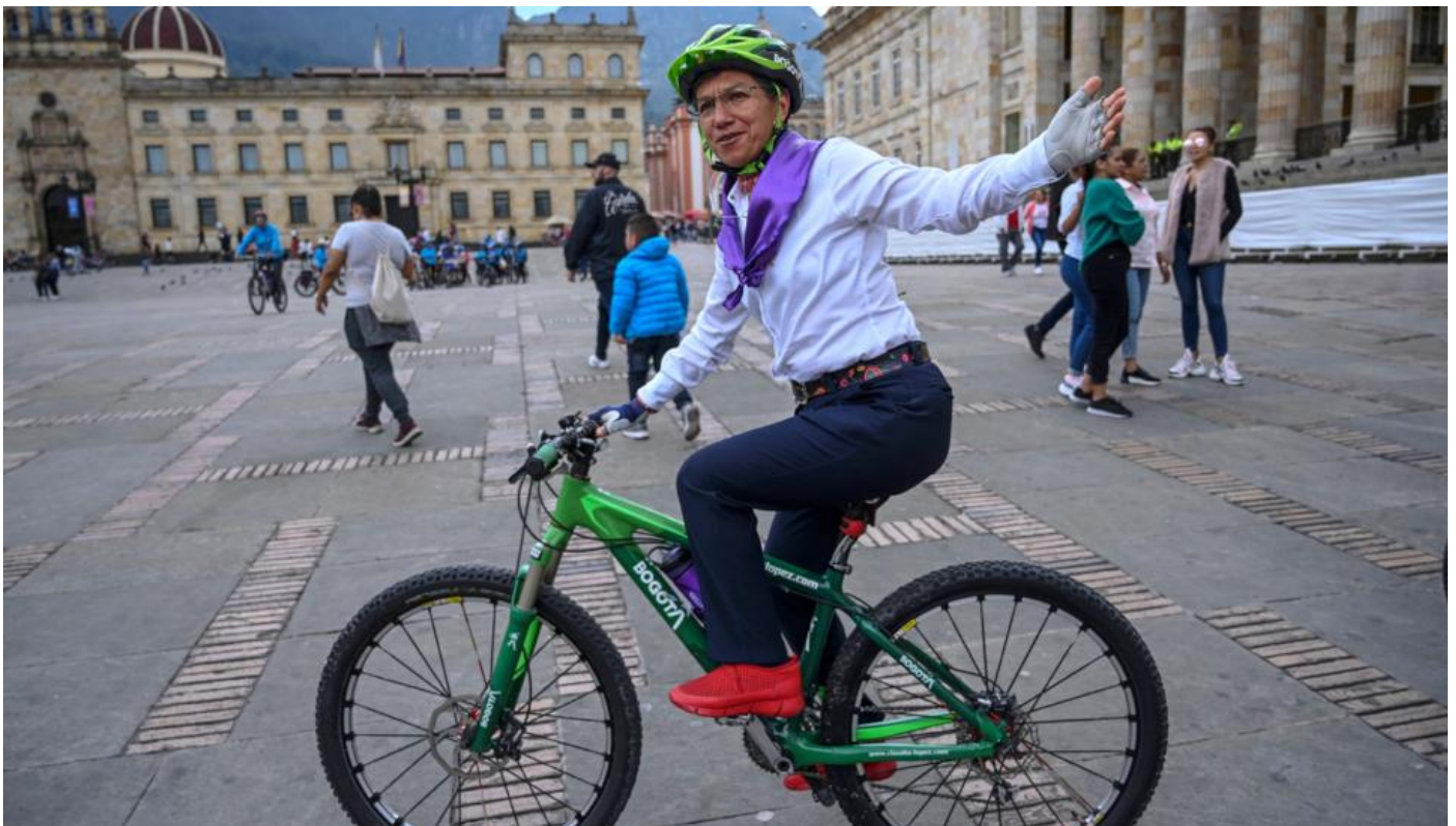
The mayor of Bogotá, Claudia López, has extended closures of streets to cars and opened additional cycle routes during lockdown

In the Colombian city of Bogotá, mayor Claudia López closed 117km (72.7 miles) of streets to cars in order to make cycling and walking easier during the coronavirus lockdown. Though these streets are typically closed every Sunday – in the long-running, pro-cycling initiative Ciclovía – Lopez has extended the closure throughout weekdays too, as well as added 80km (49.7 miles) of cycle lanes to the city’s existing network of 550km (341.7 miles).