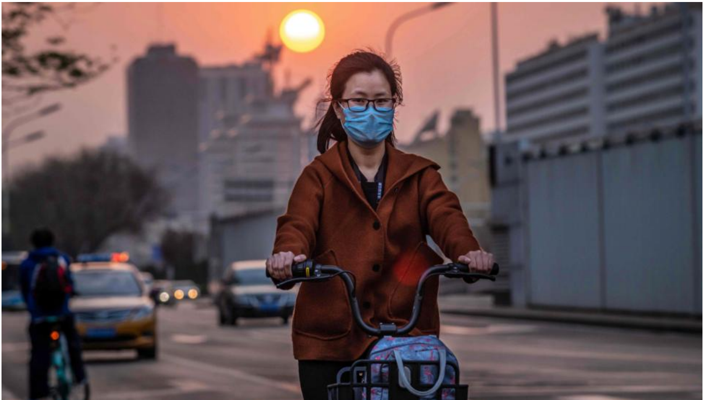
The approach in many cities has not been to ban the conventional combustion-engine car, but to make healthier and more sustainable options more convenient

So in these cities’ efforts to ensure healthier air, outright bans on cars don’t feature as a core approach. But, if their plans are successful, combustion-engine cars may well become a rarer sight.