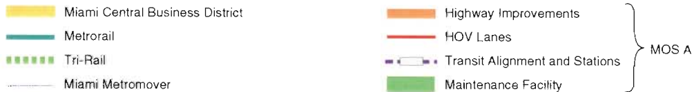
• Figure 3 MINIMUM OPERABLE SEGMENT A