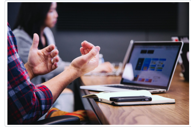
Communicating in a public health crisis