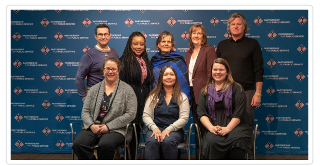
How to stay connected with remote colleagues