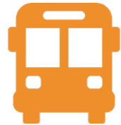
Design and Construction of new SMART Express Route