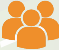
TPO Collaborating with 13 Public Agencies