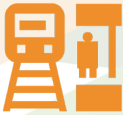
First/Last Mile Demonstration Solutions

Pursuant to Resolutions No. 14-18 and No. 29-18, the Miami-Dade Transportation Planning Organization (TPO), in partnership with the Florida Department of Transportation (FDOT), Miami-Dade County, South Florida Regional Transportation Authority (SFRTA), and numerous local municipalities have coordinated to deliver SMART Plan Demonstration projects countywide. This program of projects includes a mixture of local, regional, state and federal funding.