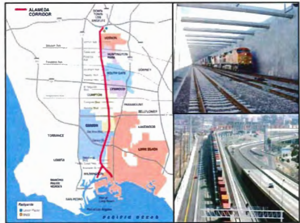
Figure ES.2 Alameda Corridor

The Port of Miami Freight Access Study ultimately was initiated to evaluate the potential for a similar facility in Miami-Dade County. Figures ES.3 and ES.4 illustrate the current rail access to the POM. Currently, the POM handles a small fraction of the volume and primarily serves a Southeast Florida regional market. This study explores the potential application of this type of infrastructure project within these parameters.