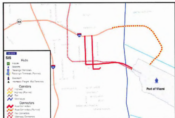
Figure ES.1 SIS Connectors

In response to restricted port access and worsening downtown congestion, local leaders continue to explore a range of improvements that would support both port growth and downtown redevelopment, while reducing traffic conflicts. Currently, the preferred alternative moving forward is a tunnel that would connect the POM with I-395 on Watson Island, providing direct Interstate access. 2 Figure ES.1 illustrates the existing Strategic Intermodal System connectors for the POM. 3 As shown, the facility currently is served by roadway (solid red) and rail (dashed red) connections, with the new highway tunnel planned for the future (dashed red with yellow). As proposed, this would be one element to alleviate a portion of the truck traffic that currently traverses the downtown. A number of other access improvements are actively being discussed by community and industry leaders.